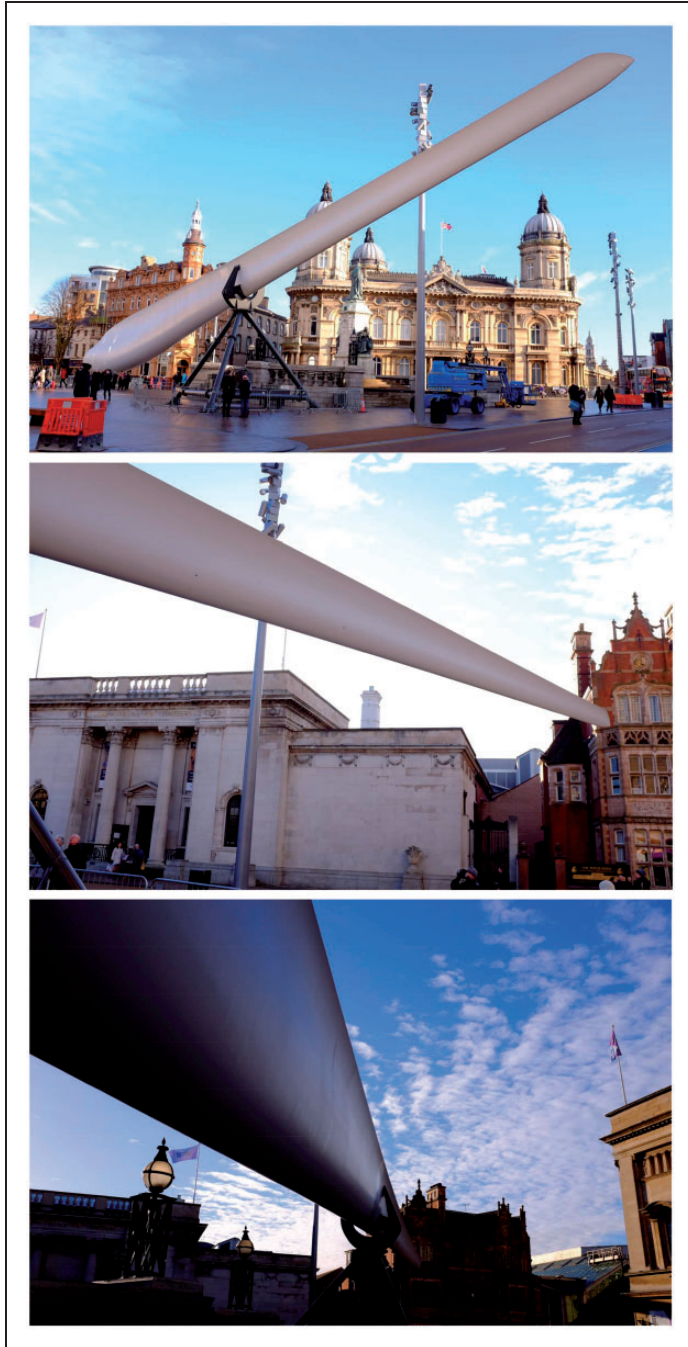
Figure 1. Three photographs of the 'Blade' installation in Victoria Square, Hull, UK. In the top two photographs, the blade appears to be cylindrical, and its lighting seems out of place with the daylight illuminating the rest of the scene. In the bottom photograph, the actual S-shaped profile of the blade is more apparent.